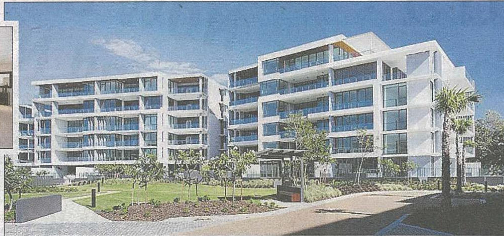
Construction of the Maricel (left) and Bijou buildings completes Allisee at Hollywell

Boulderstone's early completion of the luxurious Bijou and Maricel apartment buildings marks the final instalment of Allisee. The $259 million project has been